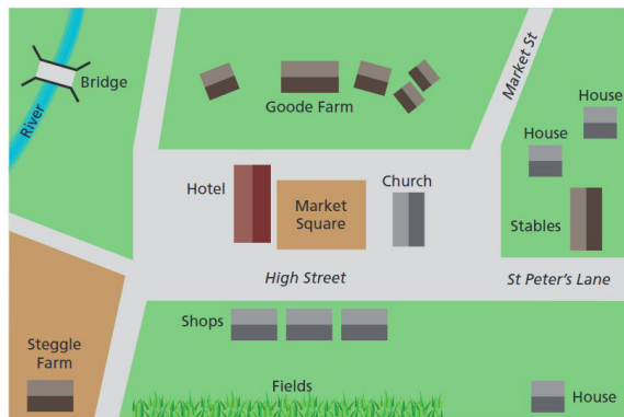
Town centre, 1700